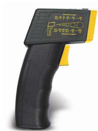
Precision calibrator for IR Thermometer