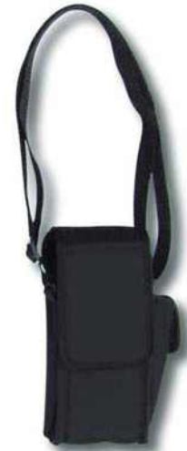
Carrying case CA-05A ( optional )