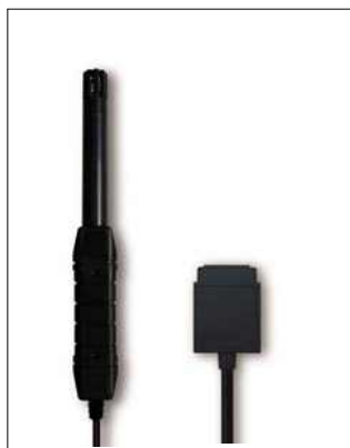
HUMIDITY PROBE, HD-200PRH