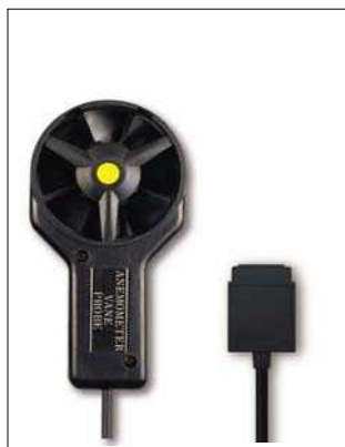
ANEMOMETER PROBE, HD-200PAL