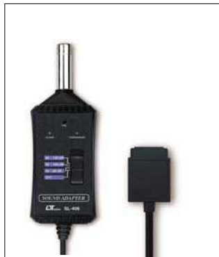
SOUND ADAPTER, SL-407