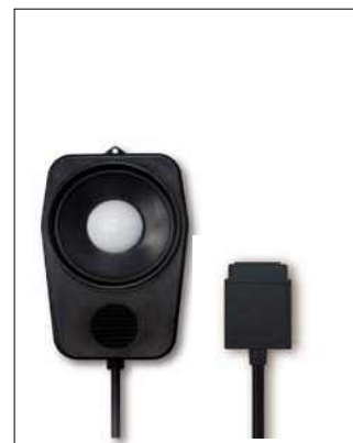
LIGHT PROBE, HD-200PLX