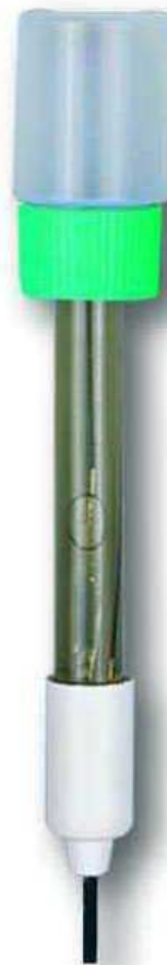
pH electrode ( optional )