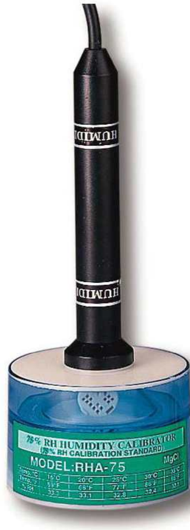
75 %RH HUMIDITY CALIBRATOR Model : RHA-75