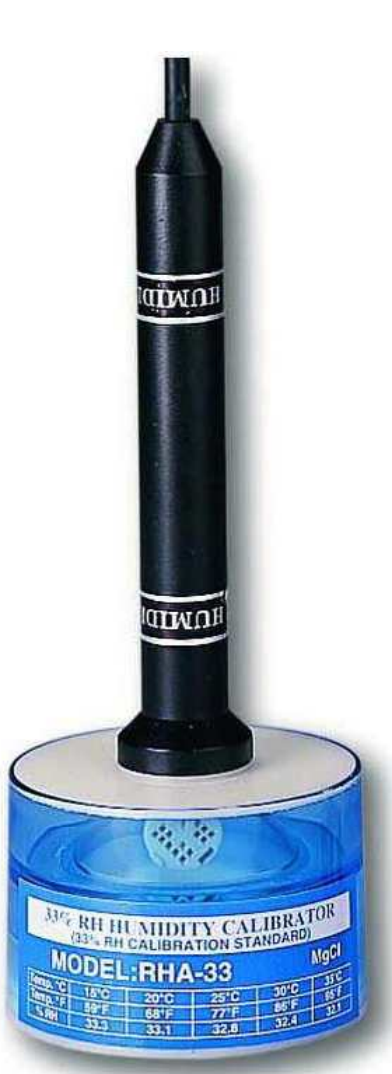
33 %RH HUMIDITY CALIBRATOR Model : RHA-33