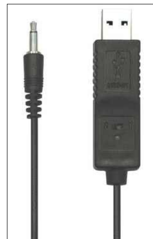
USB cable, USB-01